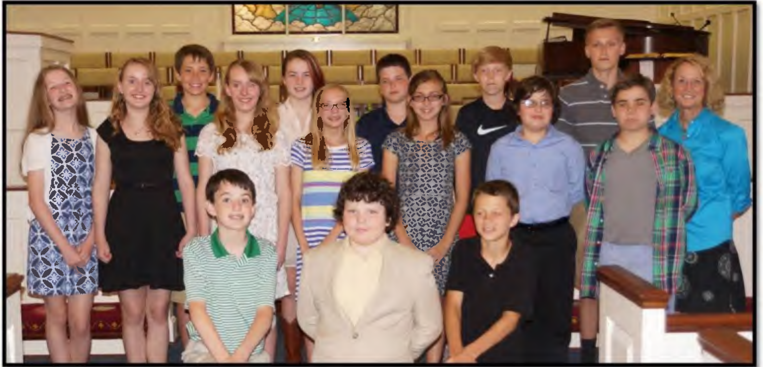
CONFIRMATION CLASS OF 2015