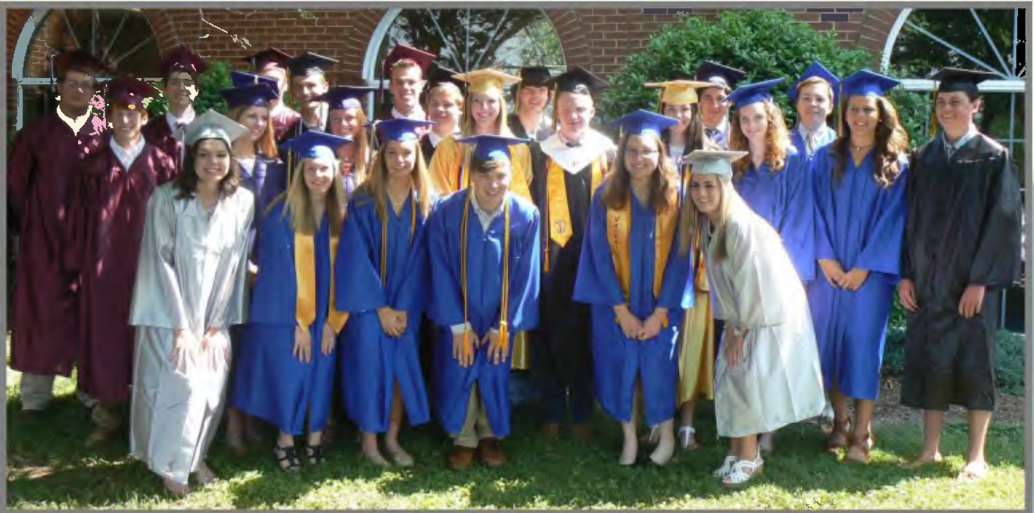
GRADUATING SENIORS OF 2015